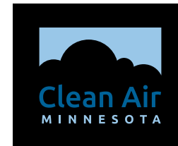
Not enough contrast between background and logo