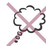
Hand-drawn or sketched icons