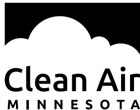
black and white logo treatment

Use the all black version of the logo when printing documents in black and white. This will prevent the logo from looking washed out when colors are converted to grayscale.