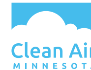
Color outside the brand color scheme

Never alter or use the logo in the following ways: