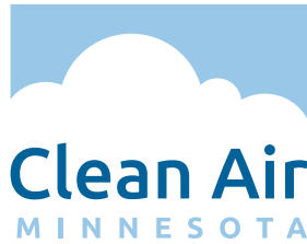
primary logo treatment

The two-color logo is the default treatment and should be used whenever possible.