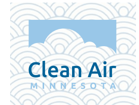
Placing logo over pattern competes for attention