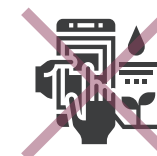
Highly stylized and/or detailed icons