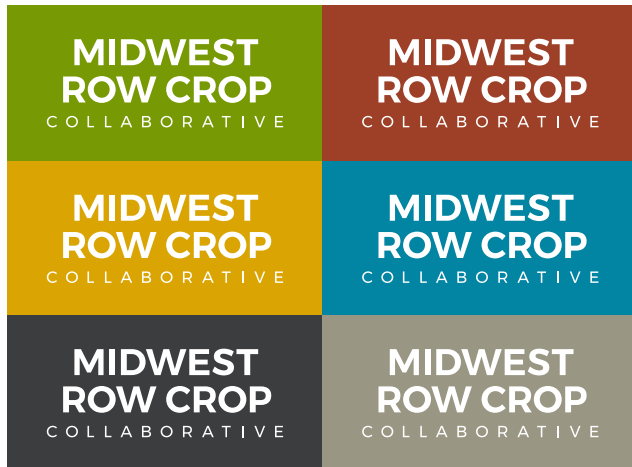
reverse logo treatments

To maximize contrast, on dark backgrounds, use the all white aka reverse version of the logo. When using it on top of a photograph, try to place it over the darkest part of the image and/or add a subtle drop shadow to the logo.