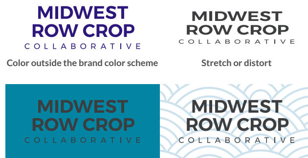
Not enough contrast between background and logo

Never alter the logo in the following ways: